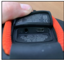
The USB charging port on the back

1/ Install the “UE Roll” app on your phone or tablet.