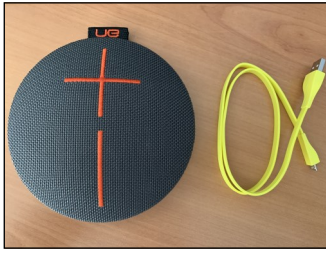
Speaker with charging cable